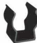
8012C Mounting Clip

Gas traps should be mounted in a vertical position to ensure proper contact of the gas with the adsorbent. Use model 8012C, 8040C or 8050C mounting clip with 8012, 8020 and 8040 Series moisture traps.